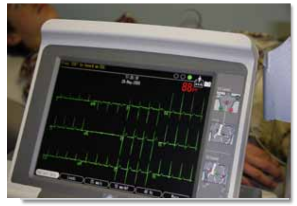
LMHS has offered pre-participation sports screenings to Licking County's student athletes in grades 7 through 12 for seven years, and has expanded the program over the years to include ECG screenings as well as ImPACT Concussion screenings that will further protect the students' health.

From May through July, Licking Memorial Health Systems (LMHS) will once again offer free pre-participation sports screenings to Licking County's youth in grades 7 through 12. Student athletes, band members, Licking County All-Stars football players and students in C-TEC's Criminal Justice, Fire and Physical Therapy programs are eligible to participate. The screening program, which is now in its seventh year, provides free baseline concussion screenings and electrocardiogram (ECG) testing in addition to the sports physical examination.