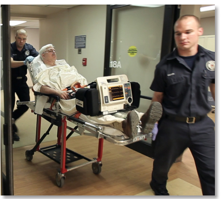
Heart attack patients who arrive at LMH by emergency squad can often be taken directly to a treatment room.

En route to Licking Memorial Hospital (LMH), the EMTs transmit the patient's EKG results and other vital data to the LMH Emergency Department (ED). The EMTs are able to administer oxygen and begin an intravenous line for fluids. If the transmitted