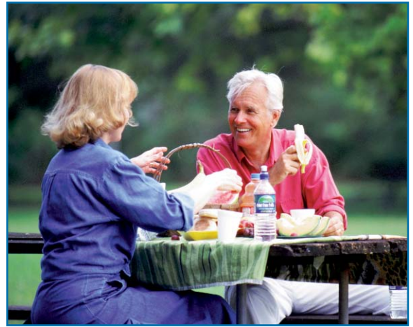
Dining with Diabetes helps people with diabetes learn how to choose and prepare healthy food.