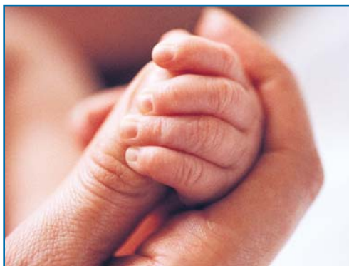
Not only are premature babies small in size, but they may also face other health issues.

When a baby is born at less than 37 weeks' gestation (gestation refers to the period of time a woman is pregnant), he/she is considered a premature infant. A full-term pregnancy is 37 to 42 weeks' gestation. Prematurity is the number one killer of newborns, according to the March of Dimes. Medical advances can help keep young, tiny babies alive. However, the earlier a baby is born, the more likely he/she is to face problems.