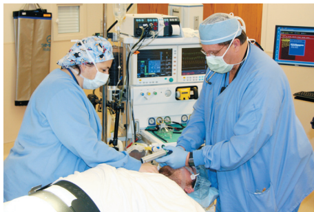
LMH surgical staff members closely observe each patient during surgery with a Bispectral monitor.

In recent years, a phenomenon known as “awareness during general anesthesia” has gained national attention. Awareness during general anesthesia is a rare occurrence where surgical patients are able to accurately recall their surroundings and intraoperative events while under general anesthesia. The patient is unable to communicate due to temporary muscle relaxing medications that are administered along with anesthesia.