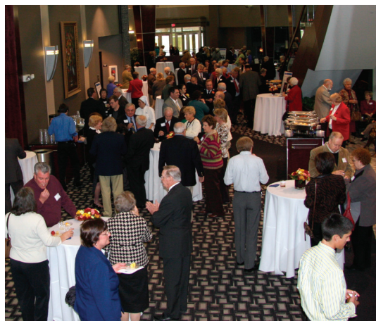
The Lifetime Achievement Reception was held at the J. Gilbert Reese Center in Newark.