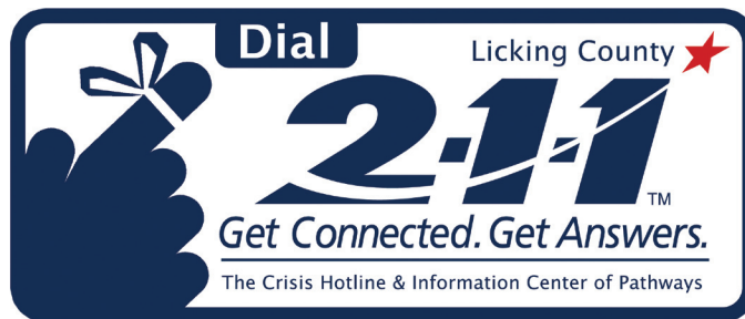
Callers can dial 2-1-1 to receive help or information on many topics.