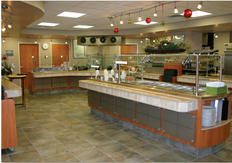
Licking Memorial Hospital's newly renovated Cafeteria features made-to-order and healthy menu choices for patients, visitors and employees.

are in response to the public's higher expectations for quality and service in all facets, including food. We've evaluated every part of the patient experience at LMH to identify areas that could be improved. We recognized that providing a convenient, high-quality meal was another way of nurturing our patients and visitors, and is therefore an important part of the healing process."