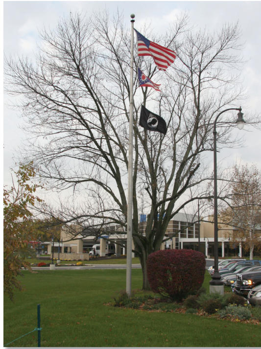
The POW/MIA flag was displayed at Licking Memorial Hospital on Veteran's Day.

Veteran's Day was observed at Licking Memorial Health Systems (LMHS) on November 11, 2007, as the official flag to honor a special group of military members flew proudly on the flagpole at Licking Memorial Hospital. The black flag is hung in honor of the military personnel who were prisoners of war or declared missing in action (POW/MIA). Many LMHS employees have served in the military or have a friend or family member currently in the military. Displaying the POW/MIA flag is a reminder that even if time passes, LMHS will not forget about those who are serving or have served this country. In 1990, the U.S. Congress declared this flag design to be the official