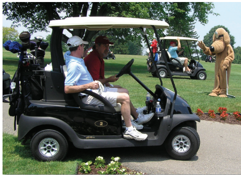
Licking Memorial Hospital mascot Scrubs waves to golfers at the 2007 Golf Gala.

We are pleased to acknowledge and thank our Ace Sponsor, Park National Bank, and our Eagle Sponsors, MedBen, Turner Construction and The Jerry McClain Companies, for their generous