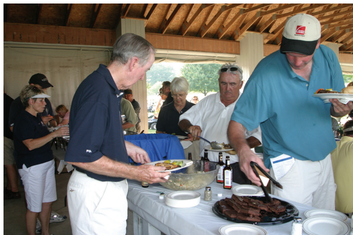
Participants of the 2007 Golf Gala enjoyed beautiful weather, good food and time with good friends while raising money to benefit Licking Memorial Hospital.

Proceeds from the 2008 Golf Gala will be used toward the Intensive Care Unit and Coronary Care Unit patient care room expansion. For more information about 2008 Golf Gala, please contact the Licking Memorial Development office at (740) 348-4102.