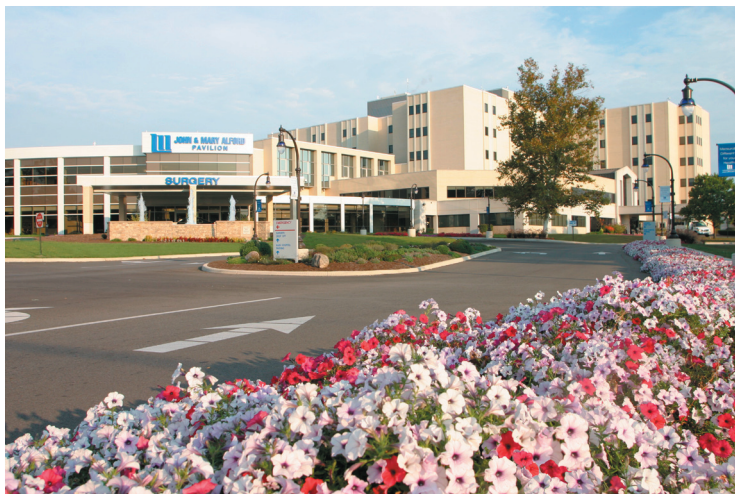
The 2008 Renovation Project at Licking Memorial Hospital is expected to be complete in 18 months.

Construction has begun in several areas on the first and second floors of Licking Memorial Hospital (LMH). The 2008 Renovation Project will add more private rooms, improve services provided to patients, enhance technology and locate physicians closer to their patients.