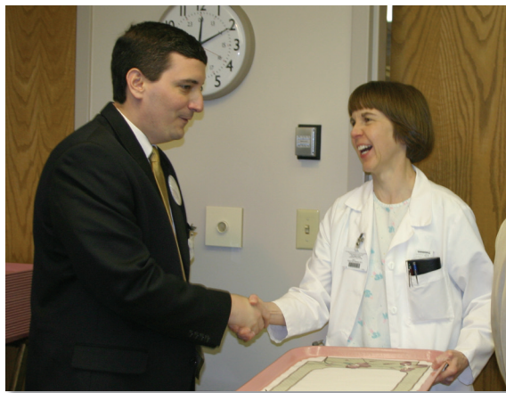
National Doctors' Day is March 30.

Licking Memorial Hospital (LMH) is pleased to honor the active medical staff on March 30, which is National Doctors' Day. The day received official recognition in 1990 when President George H.W. Bush signed a resolution to set aside March 30 to pay special tribute to the dedicated physicians who care for us and our loved ones.