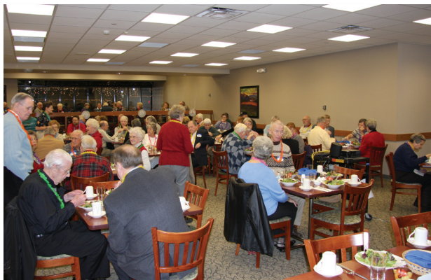
Cardiac rehabilitation patients brought family and friends together to hear about graduates of the program and how it has impacted their lives. Guests took their seats for a heart healthy meal before the evening's presentation.

The Cardiology Department at Licking Memorial Hospital (LMH) hosted the annual Cardiac Rehabilitation Dinner in January in the LMH Cafeteria. This year, the event had a cruise ship theme. Eighty-four Cardiac Rehabilitation program graduates arrived with friends and family and were greeted with Hawaiian leis and a heart-healthy meal.