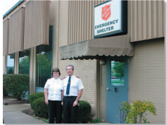
The Salvation Army of Licking County was the recipient of the "Building a Healthier Community" award in 2007.

Licking Memorial Development Council is currently accepting nominations for the fourth annual "Building A Healthier Community" award. This award recognizes an individual, group of individuals, or an organization in Licking County that has undertaken a project or achieved a goal that improves the health of the community. The award winner will be recognized at the Lifetime Achievement Reception on Sunday, October 26, 2008. An application form appears on pages 20 and 21. For more information, contact the Development Department at (740) 348-4109.