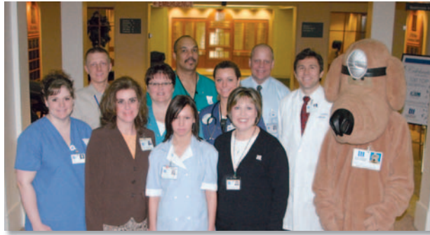
Licking Memorial Health Systems, with more than 1,600 employees, will celebrate National Hospital and Healthcare Week from May 11 to 17.

During National Hospital and Healthcare Week, Licking Memorial will host events to promote Licking Memorial employees' physical and mental health. Activities throughout the week include an employee health fair, awards ceremonies, an employee cookout, snacks, games, contests, prizes and entertainment.