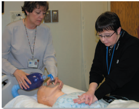
Licking Memorial Hospital has purchased a high-tech mannequin called SimMan to improve clinical training exercises.

The SimMan mannequin is 5 feet 6 inches tall and weighs approximately 85 pounds. Additional mannequins can be interchanged, using the same software. “Although