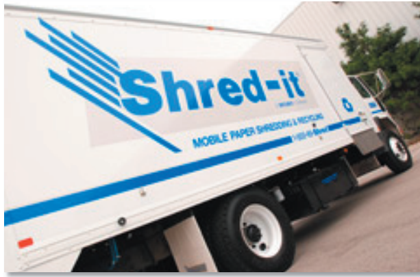
Proceeds from Community Shred Day will benefit Licking Memorial Health Systems.