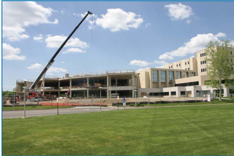
Construction at Licking Memorial will nearly double its size.

Other major projects have included the cardiac catheterization addition, replacement of an old telephone system, implementation of an electronic medical record in the physician offices, implementation of a Picture Archiving Communication System (PACS) in Radiology, the generator equipment and building addition, and the addition of oncology and dialysis services within the Hospital.