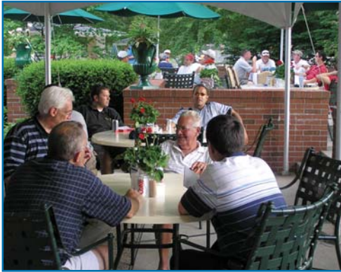
The Golf Gala 2006 will be held June 19 - be sure to join in the fun.

The Licking Memorial Development Council will sponsor Golf Gala 2006 on Monday, June 19, at Moundbuilders Country Club, 125 North 33rd Street, in Newark. Check-in and lunch is at 12:00 noon, followed by a shotgun start at 1:00 p.m.