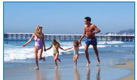
Be sure to apply sun screen every day!