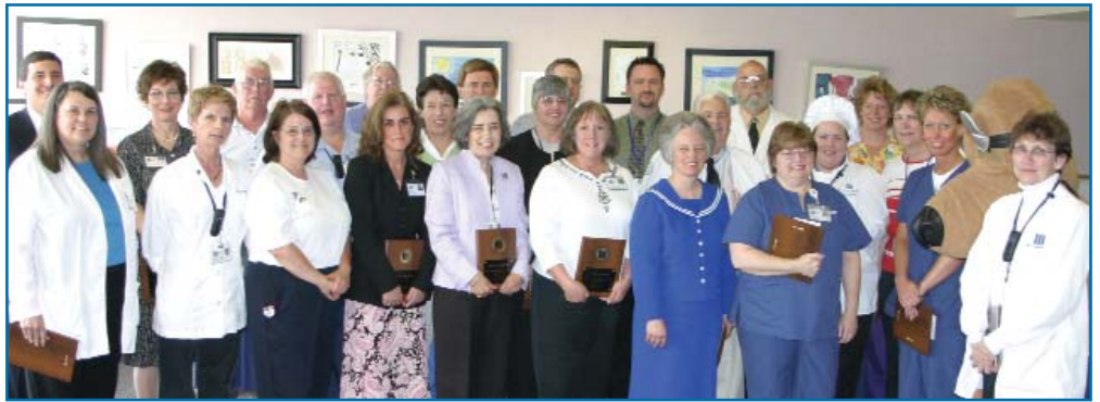
The 2007 MVPs were honored during Hospital and Healthcare Week with a ceremony and reception held in the Hospital Cafeteria. In addition to a plaque, MVPs were given a monetary gift.

Licking Memorial Health Systems (LMHS) recently recognized outstanding employees with MVP awards. Thirty employees were honored during Hospital and Healthcare Week in May. The MVPs were chosen for their consistent demonstration of the Health Systems' values of communication, attitude, respect and excellence.