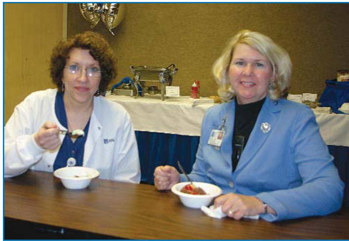
Members of Team December won the Coin Jar Challenge for LMHS' Operation Feed Campaign. They were treated to ice cream sundaes for the win.