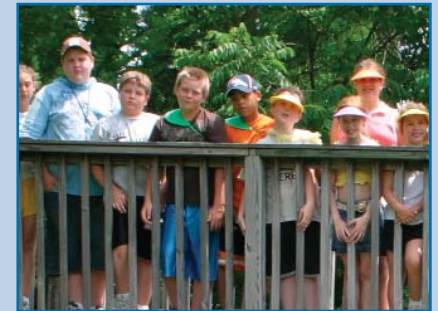
Children attending Camp Feelin' Fine stop on a bridge at Infirmiry Mound Park.

Licking Memorial Hospital's (LMH) Camp Feelin' Fine, a camp dedicated to children with asthma, provided them with information about their disease and an opportunity to meet other children who have similar experiences. The camp was held in June at Infirmiry Mound Park south of Granville.