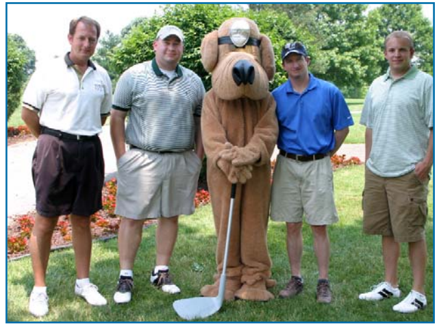
The team sponsored by Crowe Chizek & Co., LLC, pictured above with the Licking Memorial mascot Scrubs, took first place at the 2007 Golf Gala.