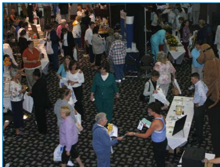
A variety of health information is available during the Women's Health Expo, slated for September 4 at the J. Gilbert Reese Center on the Newark campus of The Ohio State University and Central Ohio Technical College.

There will be something for everyone. "This is such a wonderful evening for women of all ages. It's an all