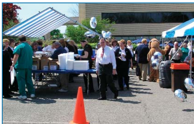
LMH provided a barbeque to show employees how much their dedication to the organization is appreciated.