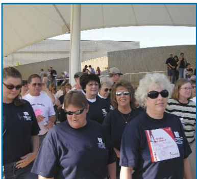
Licking Memorial Health Systems employees enjoy the Licking County Heart Walk.

at The Ohio State University Newark-COTC campus, employees walked to honor patients and co-workers who have experienced heart problems and strokes. LMHS donated money to help boost the Heart Walk’s total pledges of $20,000.