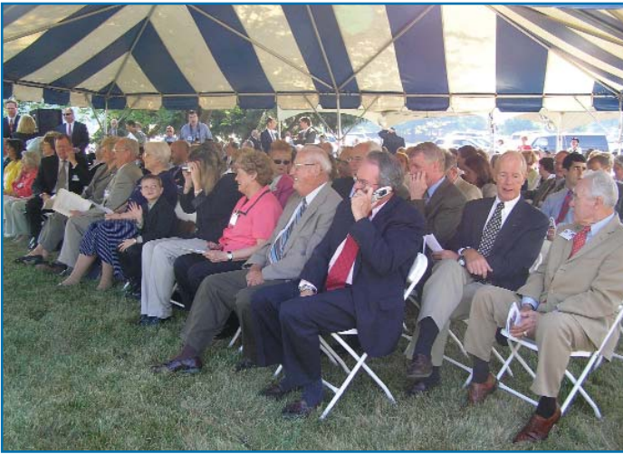
Guests were seated at the Critical Care Pavilion Groundbreaking Ceremony held on Friday, June 24, 2005.