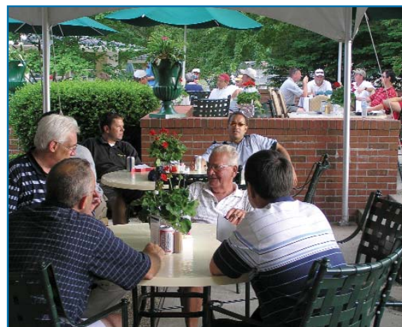
The Licking Memorial Hospital (LMH) Development Council sponsored the 2005 Golf Gala held on Monday, June 13, at Moundbuilders Country Club.