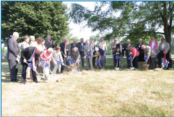
The LMH and LMHS Boards of Directors join the 12 representatives holding shovels as they prepare to break ground.

On a picturesque Friday morning, June 24, 2005, Licking Memorial Hospital (LMH) broke ground for construction of a new Critical Care Pavilion consisting of approximately 83,000 square feet of new construction and 7,000 square feet of renovation. This two-story addition will provide both a new Emergency Department and Surgery Department.