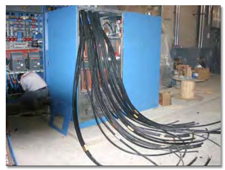
In 2006, LMH installed a state-of-the-art uninterruptable power supply (UPS) and generators to ensure a flawless power supply.

Licking Memorial Hospital (LMH) is completing work on a sophisticated new data center that will provide additional assurance of system availability, including patient information databases. The opening of the data center follows another LMH investment in high-tech backup electrical generators to address patient safety issues.