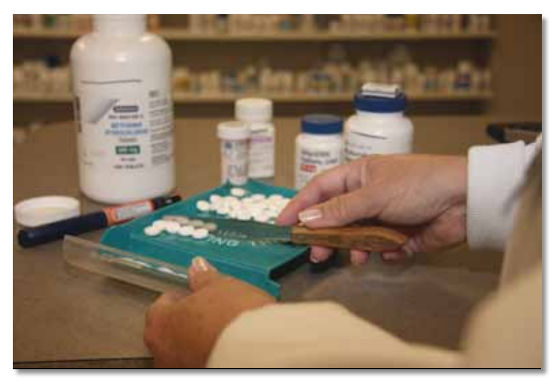
With every new prescription, be sure to ask your pharmacist or physician if there are over-the-counter drug products that should be avoided.

Another potential danger associated with OTC drugs, is that oftentimes, patients do not realize a combination formula OTC or prescription drug they are taking contains acetaminophen or an NSAID ingredient. For example, NyQuil and Theraflu both contain acetaminophen, as do the prescription pain killers, Percocet and Vicodin. Patients who take acetaminophen in addition to these drugs without checking first with their physician would be at risk of a dangerous overdose and possible liver damage.