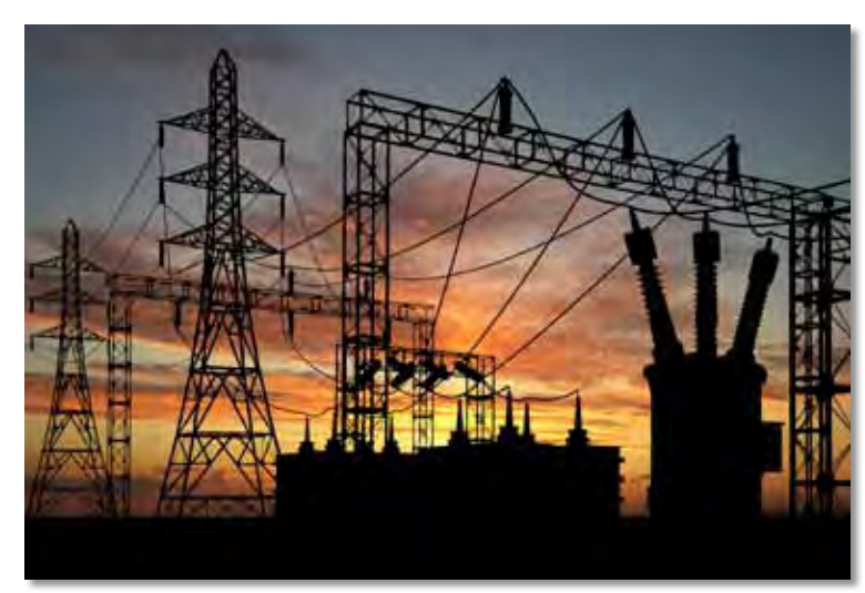
Through the Demand Response program, Licking Memorial Hospital is able to voluntarily decrease its energy consumption from the 13-state power grid during peak times by producing most of its own electricity with generators.

LMH's generators operate on diesel fuel. They are tested weekly to ensure they are working properly whenever they are needed.