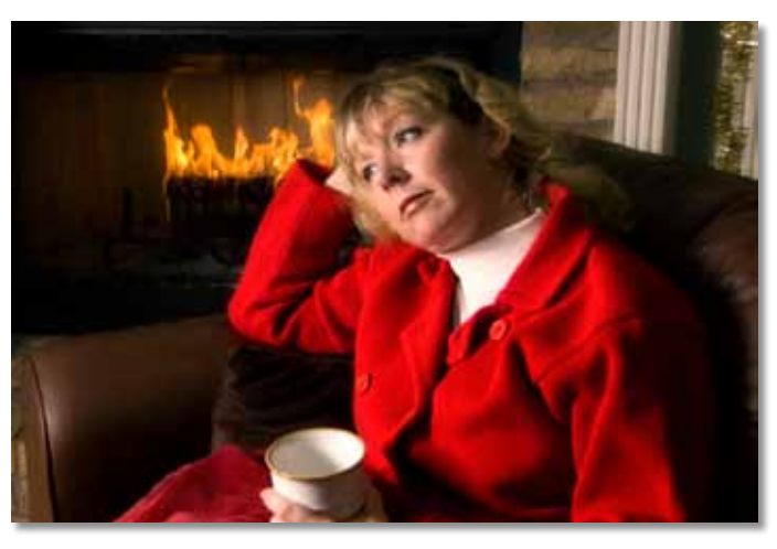
People who feel depressed during periods of shorter daylight may be suffering from a treatable condition known as seasonal affective disorder.

In mid July, the sun rises at Newark just after 6:00 a.m., and sets just before 9:00 p.m., providing approximately 15 hours