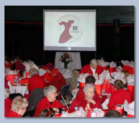
Licking Memorial Health Systems will host its annual The Heart Truth: A Red Dress Event on Thursday, February 3, at the Bryn Du Field House in Granville.

Association's (AHA) Go Red for Women Day, which is celebrated nationally on Friday, February 4.