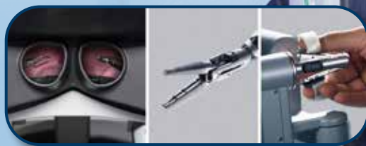
da Vinci Surgical System

LMH physicians and medical staff received training on the Surgical System during the summer, and the first surgical procedure using the robot was performed in August. The Surgical System is used in procedures such as hernia repair, gall bladder removal, prostate surgery, and colorectal surgery. Some urogynecology and general surgery procedures also utilize the new system.