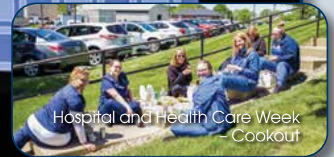
Hospital and Health Care Week - Cookout