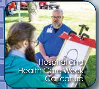
Hospital and Health Care Week - Caricature