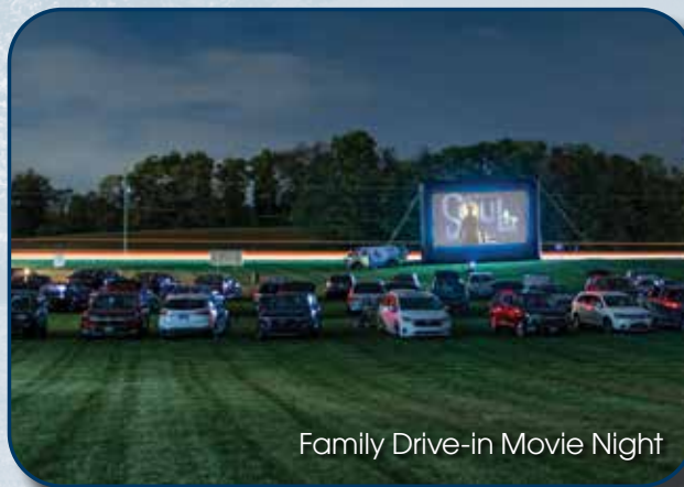
Family Drive-in Movie Night