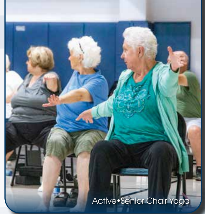
Active•Senior Chair Yoga

The 2021 "For Your Health" 5K Run/Walk and 1-mile Fun Walk was held virtually from July 24 through July 28. Participants raced remotely on their favorite local routes at a convenient time, while simultaneously