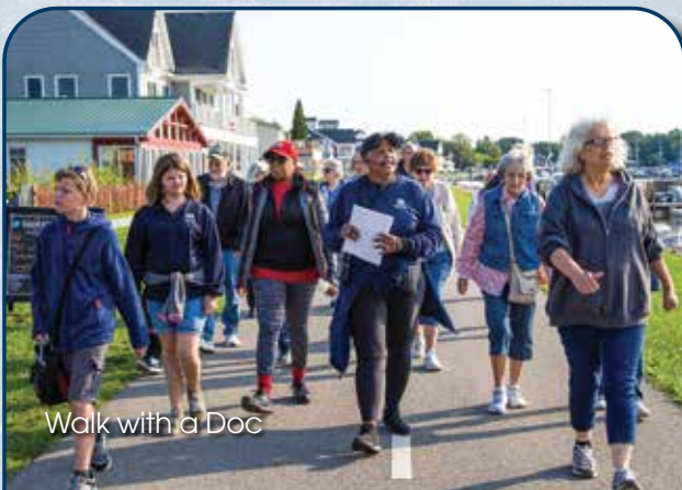
Walk with a Doc

Each month, LMHS Active Medical Staff physicians were joined by community members as they enjoyed a walk at various locations in Licking County, including Infirmary Mound Park and Wildwood Park in Granville. During the walk events, the physicians led discussions on various topics, such as the importance of physical activity, obesity, and how to make the most of an office visit with your physician. The Walk with a Doc events for January through April were streamed live on Facebook. Participants were encouraged to walk in their neighborhood, at a park, on a walking path, or on a treadmill as they viewed presentations from the LMHS physicians.