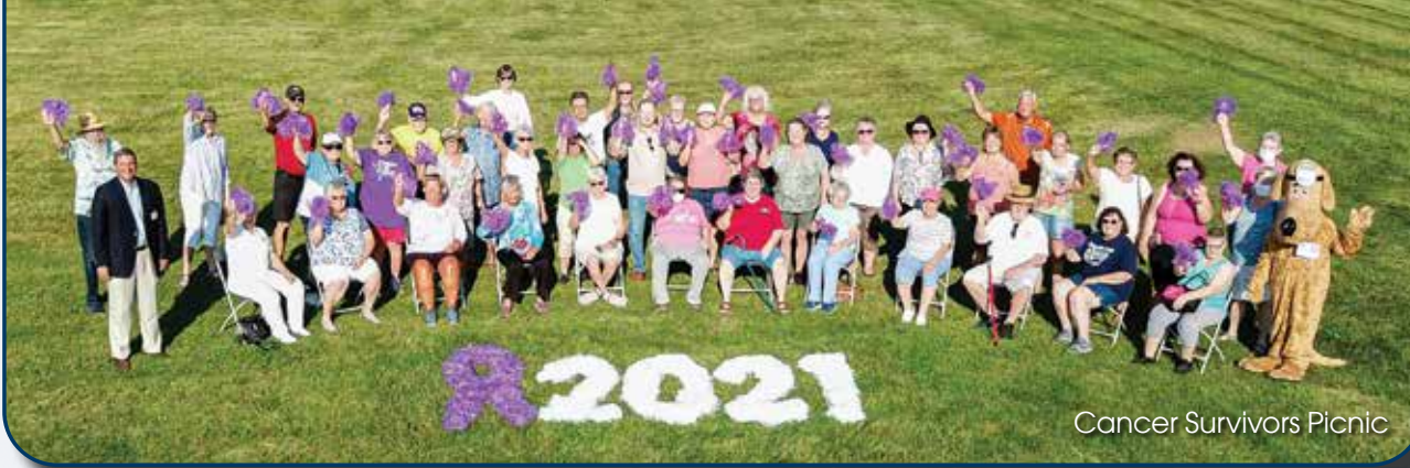
Cancer Survivors Picnic