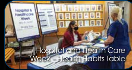
Hospital and Health Care Week - Health Habits Table