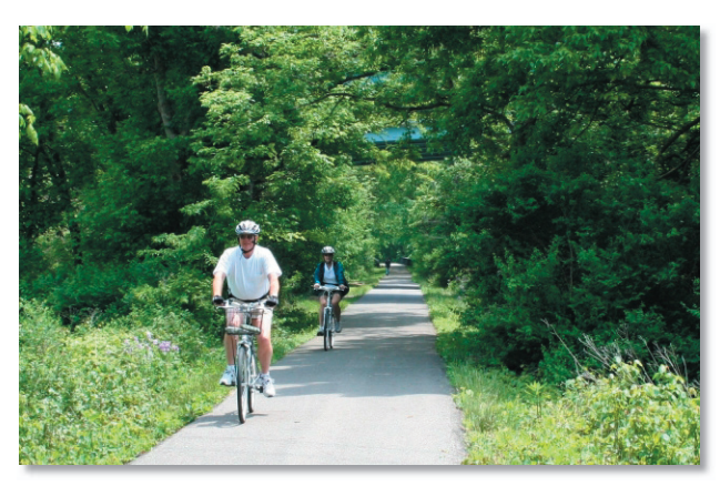
Many Licking County residents enjoy exercising at sites operated by the Licking Park District. However, the Park District's programs are likely to suffer cutbacks unless a 2mill tax levy is passed on May 4.

The Licking Park District is the only countywide agency preserving open space and providing outdoor recreation services to the citizens of Licking County. The Park District is responsible for the care and upkeep of over 1,500 acres of open space parkland and 25 miles of bike paths. However, due to increased competition for county tax dollars, the Park