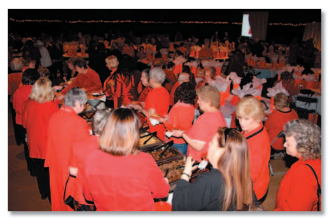
Many of the guests at The Heart Truth – A Red Dress Event wore red outfits.

Licking Memorial Hospital (LMH) presented the sixth annual "The Heart Truth – A Red Dress Event" on February 4 to a record attendance. Approximately 300 guests gathered at the Bryn Du Field House in Granville to learn about women's heart health and to sample heart healthy foods.