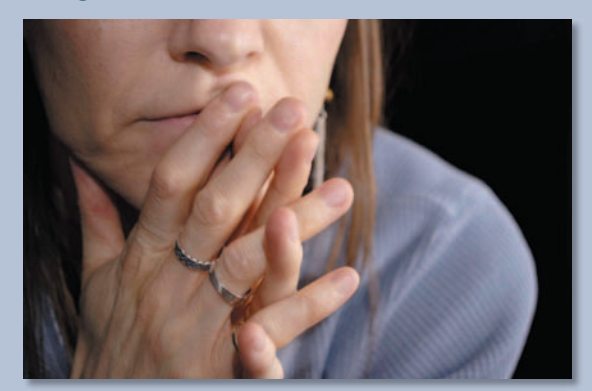
LMHS' free community education program, Anxiety/ Depression/Stress Management will discuss the effects that stress can have on a person's overall health.

Many people feel anxious or depressed after a difficult situation, such as losing a loved one, going through a divorce or losing a job. These feelings are normal reactions to life's stressors, but some people experience these feelings on a long-term basis, making it difficult to carry on with normal, everyday functioning. These people may have an anxiety disorder and/or depression that require treatment. Anxiety/Depression/Stress Management is an educational