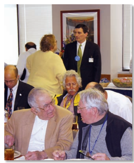
Licking Memorial Hospital celebrates National Doctors' Day with a special breakfast, a luncheon and gifts for all physicians on the Active, Consulting, Honorary and Medical Staffs.

"When patients make a contribution in their physicians' names, they are honoring the physicians' dedication in a deeply gratifying manner. It means so much to the Medical Staff to know that the community is supporting their efforts.