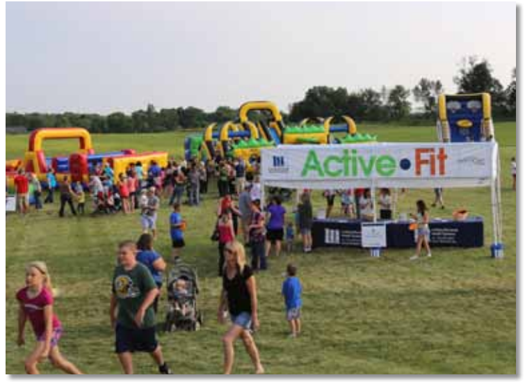
The Pataskala Health Campus hosted the first Active•Fit event of the summer with inflatable fun areas and games for Licking County youth.

The Active•Fit Youth Wellness Program is wrapping up an incredibly successful inaugural year of promoting healthy lifestyles and habits for Licking County children. Over the past 12 months, more than 1.100 children, ages 6 to 12, enrolled in the free program to learn about the benefits of exercise, healthy eating and proper rest. A collaborative effort between Licking Memorial Health Systems (LMHS) and Newark Advocate Media, the Active•Fit Program motivates children to choose personal health and fitness goals, and lays the foundation for a lifelong commitment to personal wellness.